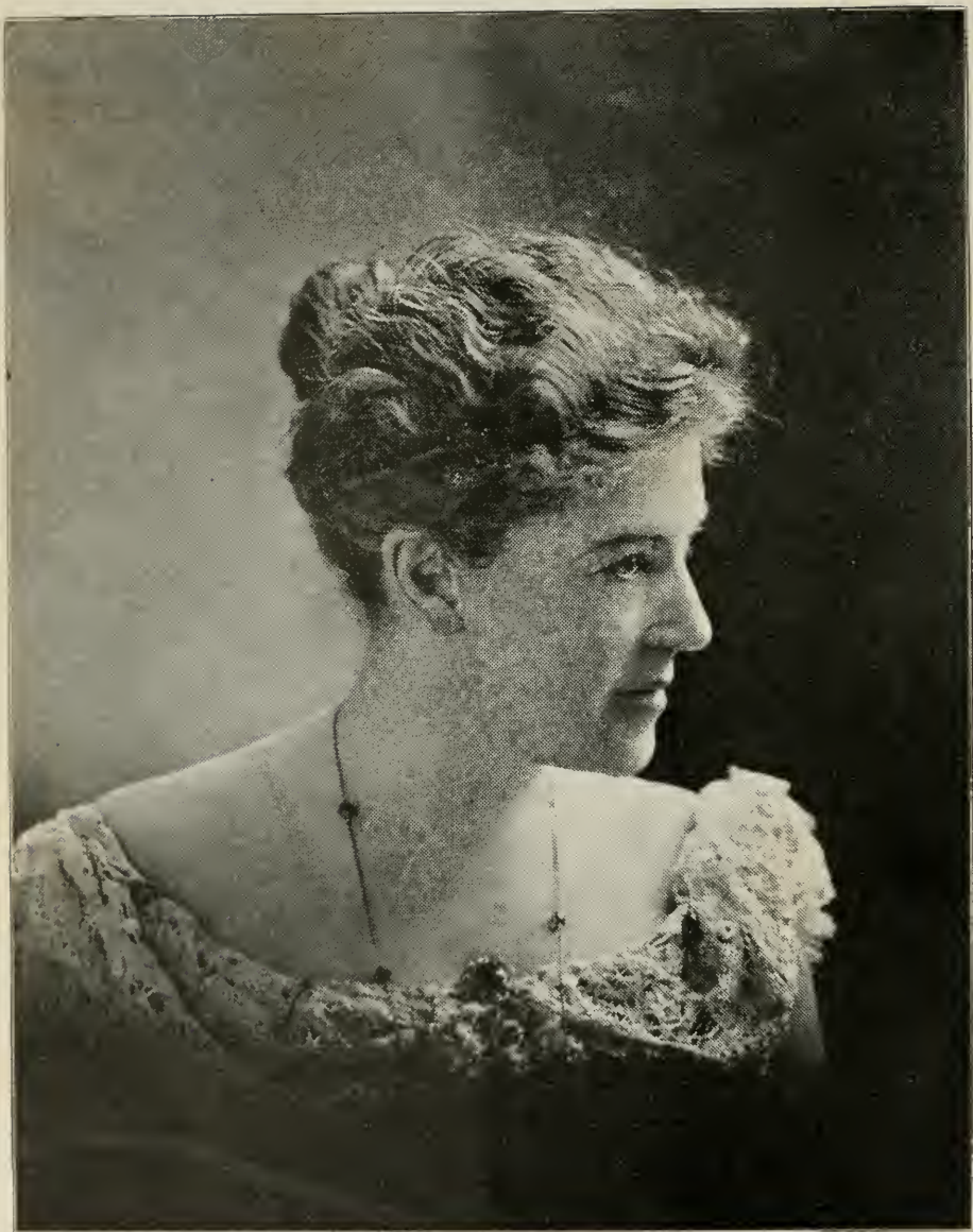
Ella Wheeler Wilcox