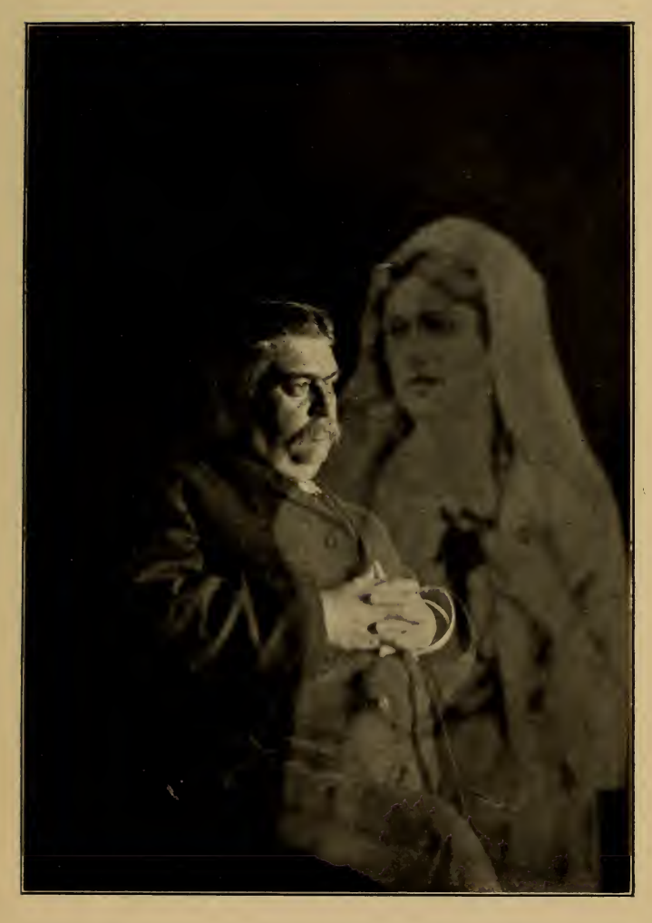
Copyrighted 1904 AN ANGEL INSTRUCTOR FROM THE HIGHER HEAVENS REFLECTING HERSELF FROM SPIRIT LIFE.