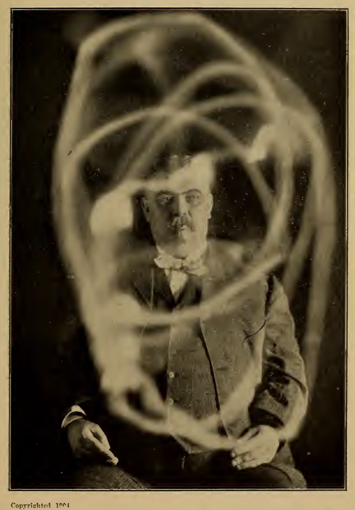
THE MAGNETIC EMANATIONS AND SPIRIT FORCE COM-BINED IN CIRCULAR PROCESS ACTION BEFORE CONCENTRATION,