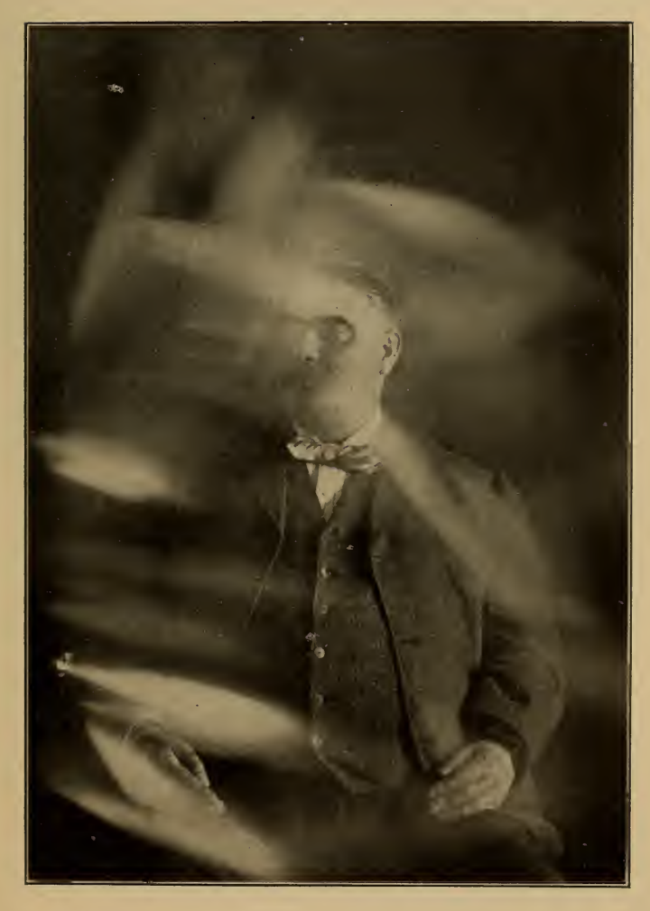
Copyrighted 1904 THE SOUL FORCE OR MAGNETIC EMANATIONS FROM THE BODY OF THE DOCTOR.