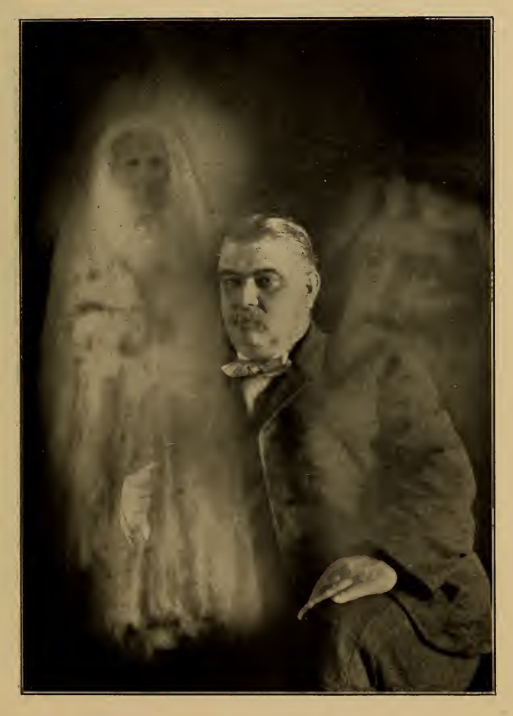
Copyrighted 1904 THE TWO SPIRIT REFLECTIONS ARE MY ANCESTORS ON THE MOTHER SIDE OF THE HOUSE.