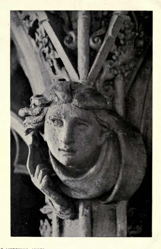
THE LISTENING ANGEL. From Southwell Cathedral.