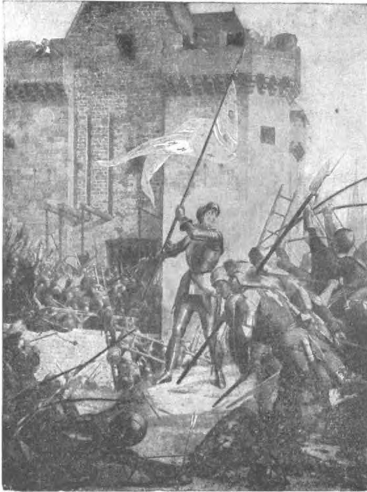
THE SIEGE OF ORLEANS.

for the incarnation of the Divine Feminine. Her character and her mission were adapted to the need of the hour, but they were not produced by it.