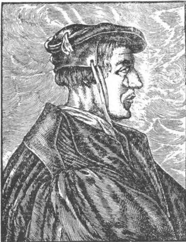
HENRY CORNELIUS AGRIPPA VON NETTESHEIM. (1486-1535.)

of the solar system (including sun and moon) and the days of the week, birds and beasts, colours, herbs and precious stones—all, according to old-time occult philosophy, are connected by the sympathetic relation running through all creation, the knowledge of which was essential to the magician ;—as well, also, the chief portions of the human body, for the old transcendentalists, especially Paracelsus, taught that man is a microcosm