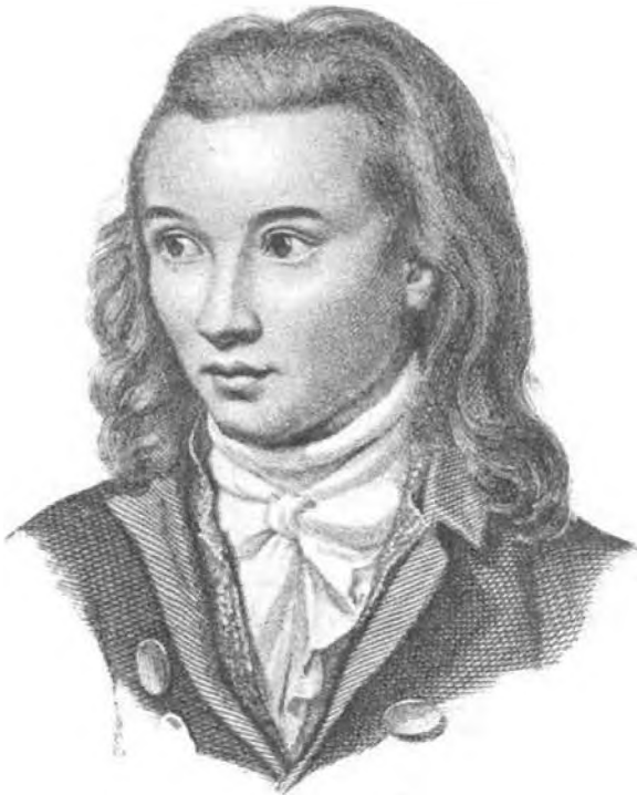
NOVALIS (FRIEDERICH VON HARDENBERG). (1772-1801.)

youngster his desire for chocolate has reference entirely to the pleasant sensations arising when the confection is eaten. Then, consciousness is an essential factor in the satisfaction of his desire, and we cannot avoid the conclusion that what he really desires is the idea of chocolate, or, to speak more precisely, the idea of eating chocolate. True, by the power of his imagination he can conjure up in his mind this desired idea, without the aid of the external world; but the idea thus arising is vague, hazy, ill-defined, and does not bring satisfaction. Let him,