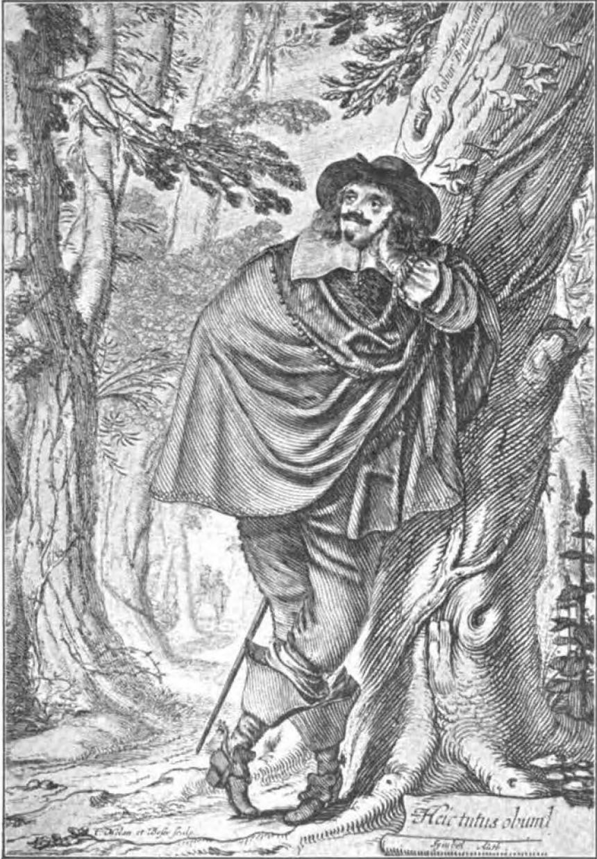
PORTRAIT OF JAMES HOWELL (1594 ?-1666).

By Claude Melan and Abraham Bosse.