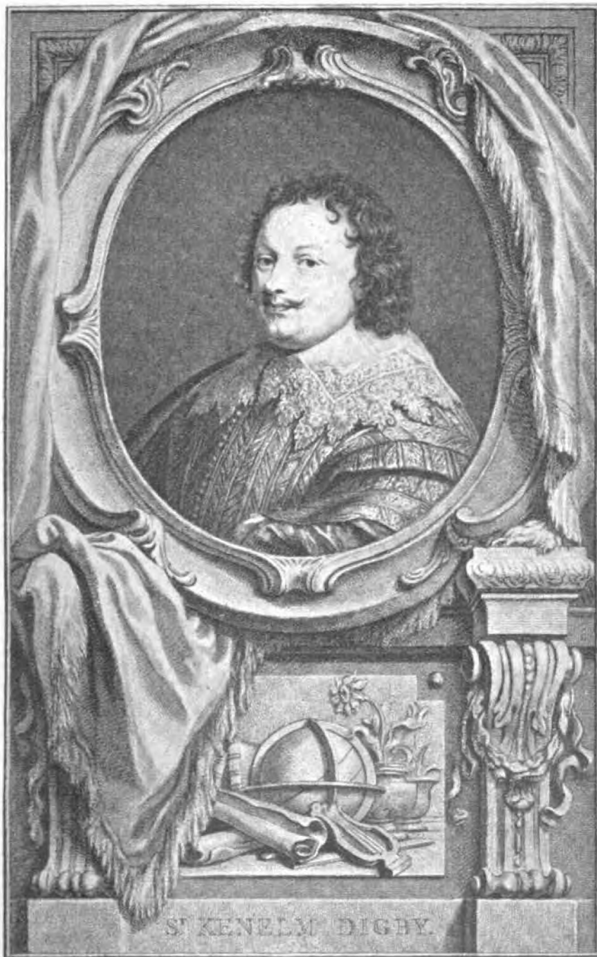
11 PORTRAIT OF SIR KENELM DIGBY (1603-1665).

(From an Engraving by Houbraken after Vandyke.)