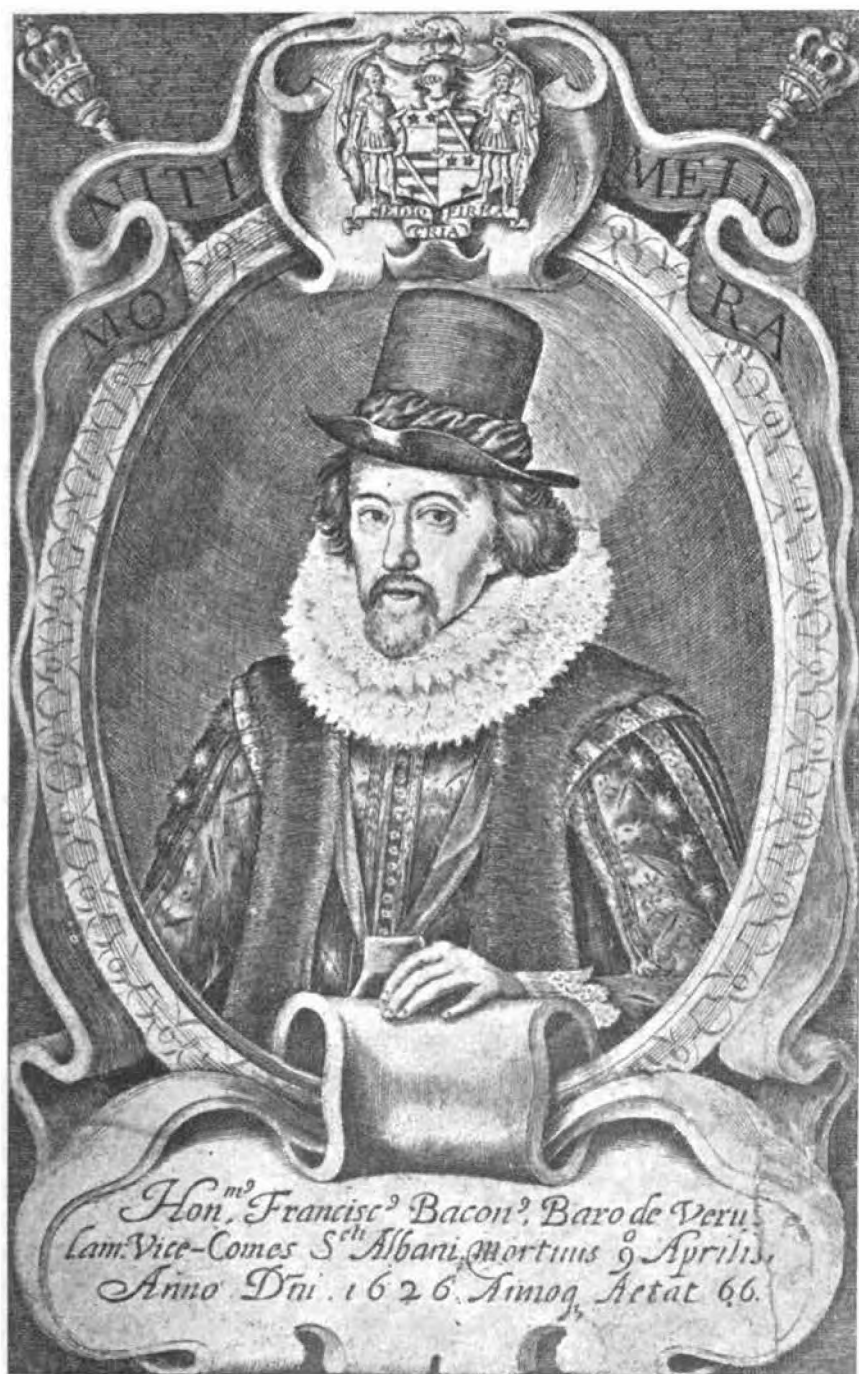
PORTRAIT OF FRANCIS BACON (1561-1626). (From the Frontispiece to the Sixth Edition of his Sylva Sylvarum .)