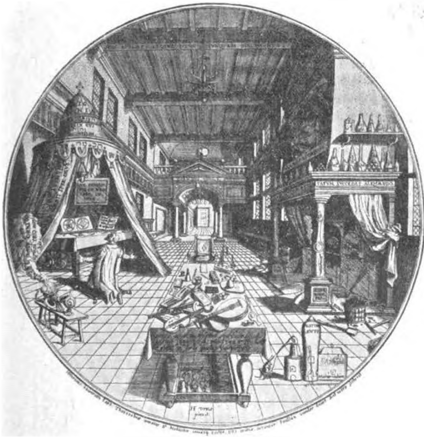
THE ORATORY OF THE ALCHEMIST.