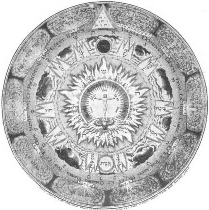
THE VISION AT THE CENTRE.

as a whole is that the work of the alchemist belongs to the path of devotion, notwithstanding (a) the material vessels with which the kneeling figure is surrounded in the first and on which his back is turned somewhat significantly; (b) the message of the Latin dictum—that work is prayer. I conclude that here inward work is adumbrated. The suggestion of the second plate is that the Gate of Wisdom is one which is opened by prayer, but the latter