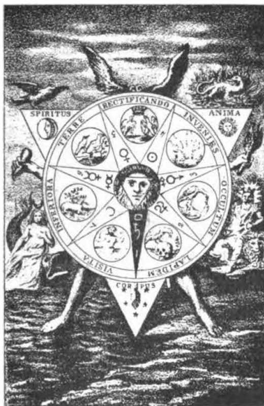
THE GREAT HERMETIC ARCANUM. (After Basil Valentine.)

In justification to myself I have wished to make this point clear, lest the question should arise why I, as a mystic, have undertaken such a task. I have therefore written the present notice as a kind of Advertisement from Eleusis concerning the