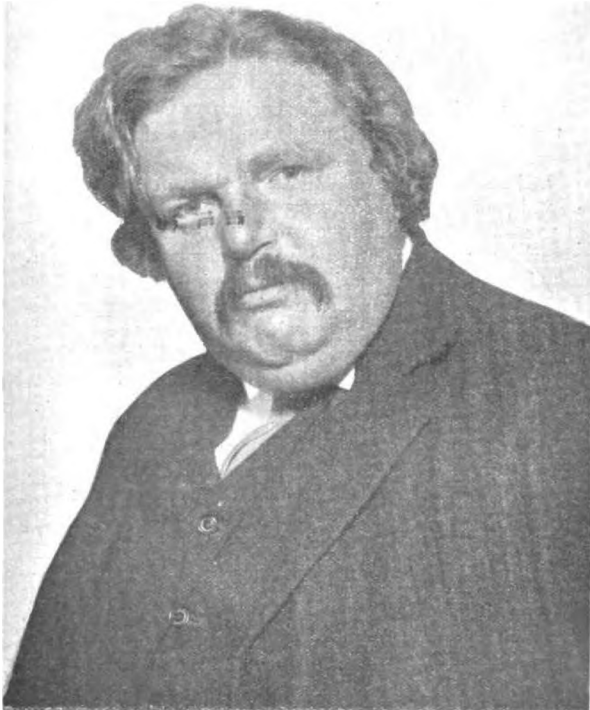
MR. G. K. CHESTERTON.

burning, crimson flame of passion into the cool, white light of faith, and kisses her gently on the forehead. He is in no sense a bad husband, nor wanting in kindness, but that gentle kiss on the forehead may be taken as symbolical of his whole attitude to-