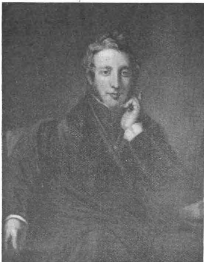
EDWARD BULWER (AFTERWARDS LORD LYTTON).

think, escaped his biographer's notice. The most renowned occultist of his day was the Abbé Constant, generally known under the pseudonym of Eliphas Levi, author of L'Histoire de la Magie, Dogme et Rituel de l'Haute Magie , etc., etc. Now not only was Lord Lytton Grand Patron, as already stated, of the Rosicrucian Order, but there is strong reason to believe