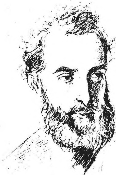
LORD LYTTON (1869).

(Reproduced by kind permission of Messrs. Macmillan.)