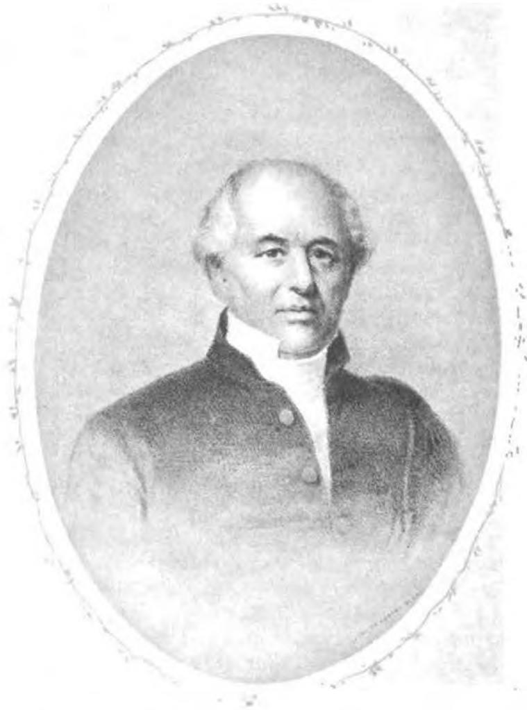
THE REV. ELEAZAR WILLIAMS.