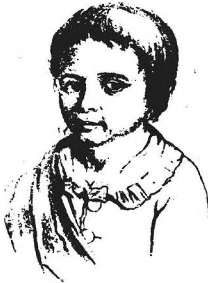
LOUIS XVII. (?)

of whose fate we know. He was taken, disguised as a girl, to the camp of Général de Charette at La Vendée, thence to La Rochelle, and in 1796 he joined the Prince de Condé in Holland. Reasons of policy having led this prince, his knowledge notwithstanding,