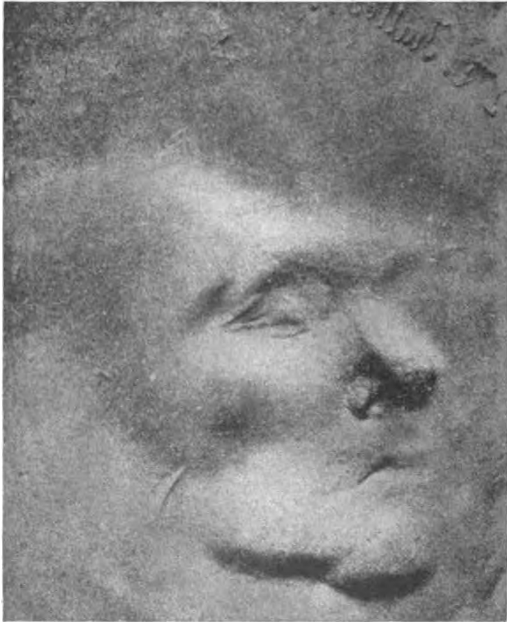
PLASTER CAST OF IMPRINT MADE IN PUTTY WITHOUT CONTACT BY THE MEDIUM EUSAPIA PALADINO.

sake of any sect, nor of any group, nor, in short, of any person whatever," that he has entered the field of controversy, but "solely for the sake of facts," the reality of which he ascertained several years ago, yet "without having discovered their cause." This latter statement ought to have a salutary effect upon those self-confident researchers who loudly affirm their knowledge of psycho-physical causes, and may even serve to moderate the