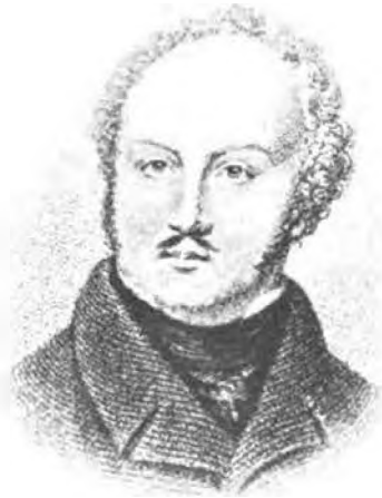
KARL LOUIS NAUNDORFF.