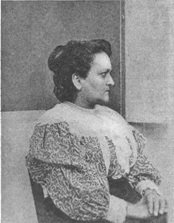
PHOTO OF EUSAPIA PALADINO, SHOWING RESEMBLANCE OF THE IMPRINT IN PUTTY.

prematurely and before a thorough knowledge of all the facts, one is apt to strain the theory or obscure the facts. So, according to the expressed opinion of Messrs. V. Sardou and C. Flammarion, it is well that Spiritualism should for the present concern itself with a series of phenomena of which Science cannot offer any explanation. For even if we admit the "communications" as evidence of an intelligence directing the phenomena,