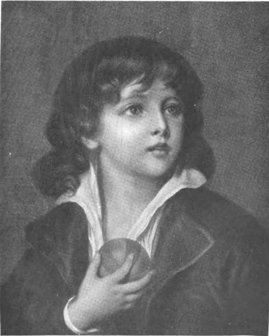
THE LITTLE DAUPHIN.